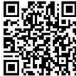
Blackberry or Other Users

Access your convention information through the groups tab by entering the code: kamuohk2011 (case sensitive). Also available is information on local dining, shopping, near-me mapping, events, coupons, and more!