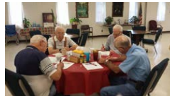
DeSoto Senior Center