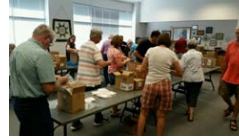
Volunteers assembling dental kits