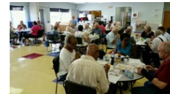
Lenexa Senior Center