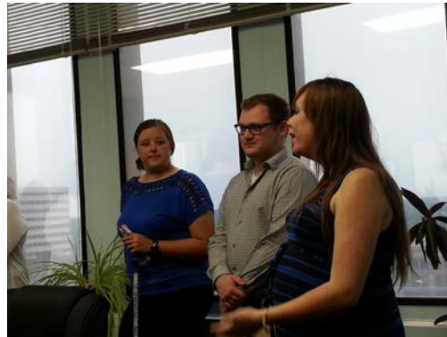
Washburn University Leadership Institute students

WIBW shared a video of the students presenting a second Aleshire award. We would like to thank United Way of Greater Topeka and Washburn University for this opportunity! We are eager to get started!