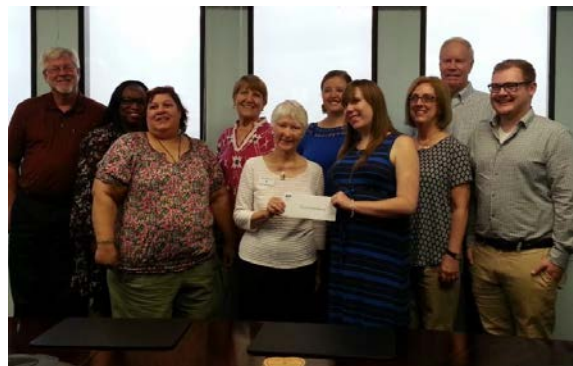
Shawnee County Coalition leaders and Washburn University students