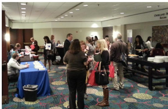
Last year's participants visiting exhibits

We still have exhibitor slots open for the 2017 Oral Health Kansas conference! The conference will be held on November 2nd and 3rd, 2017 at the K-State University, Olathe Campus building at 22201 W. Innovation Dr. Olathe, KS 66061. Exhibitors will have the opportunity to visit with participants as well as attend conference sessions.