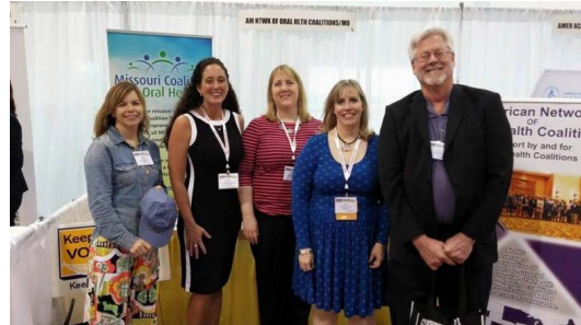
OHK Staff met with other state oral health coalitions this week

opportunities to share some of the good work being done in Kansas, including round table presentations about the highly successful Salina water fluoridation campaign and about about cultivating community coalitions.