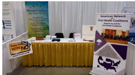
The Oral Health Kansas and Missouri Coalition for Oral Health exhibit

Staff also co-hosted an exhibit with the Missouri Coalition for Oral Health. The exhibit was a chance for the two local oral health advocacy organizations to share our work with people in the region and across the country.