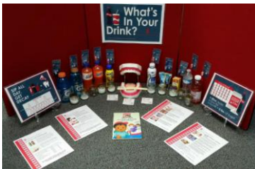
Child drink display

What is a Sugary Drink Display? It's our drink display that has 10 popular beverages and shows how much sugar is in each. We also include some of our Tips and Tricks fact sheets and brush your teeth mirror clings! The display is free to use for up to a month, and we reimburse postage!