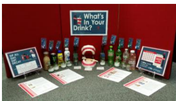
Adult drink display

What is a Sugary Drink Display? It's our drink display that has 10 popular beverages and shows how much sugar is in each. We also include some of our Tips and Tricks fact sheets and brush your teeth mirror clings! The display is free to use for up to a month, and we reimburse postage! Need it for just a one day event? That's ok too! We have people reserve the drink display for health fairs and even parent teacher conferences.