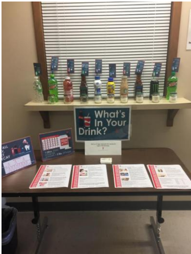
One of our sugary drink displays at PrairieStar Health Center

Our sugary drink display contains 10 popular beverages and shows how much sugar is in each. We also include some of our Tips and Tricks handouts and mirror clings! The display is free to use, up to a month and we reimburse postage!