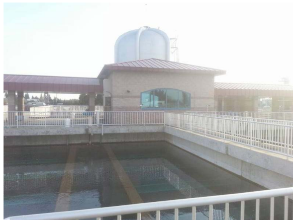
Tour of water plant in Sacramento