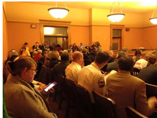
A large crowd gathered for the House Health and Human Services Committee's hearing on Medicaid Expansion

Please consider urging your legislators to support Medicaid Expansion and extend preventive dental care to low-income Kansans. Visit www.openkansas.org to find your legislators and their contact information. Or, contact Oral Health Kansas for details about how to contact them.