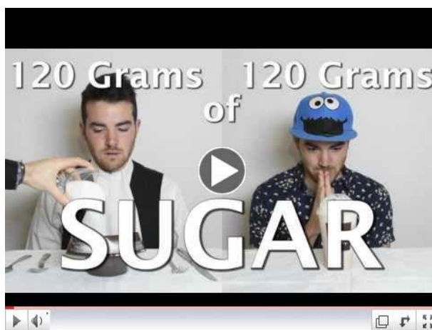
How Humans: Eat Sugar

Check out the video, and then contact Oral Health Kansas to reserve our sugary drink display. Let's all work together to spread the word about the dangers of sugary drinks and what a better idea it is to choose water!