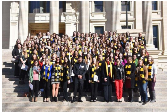
Advocates on the statehouse steps.

On January 10, about 160 advocates gathered at the Capitol to promote the new dental therapist legislation. The Kansas Dental Project introduced a new bill this year that would create a midlevel dental professional known as a dental therapist. The bill is assigned to the Senate Public Health and Welfare Committee, but it has not been scheduled for a hearing yet. Track SB 413 and read the full text on the Kansas Legislature's website .