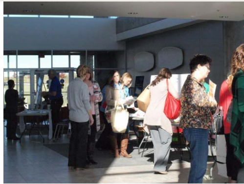
Visiting with exhibitors

If you are interested in reserving a drink display for December or the 2016 year, email us! It is free to use and shipping is reimbursed! This is a great way to remind families during the holiday season, how much sugar their favorite beverages have!