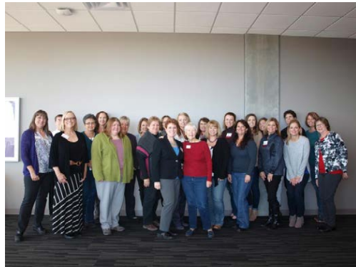
Saturday session participants