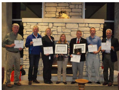
Water Fluoridation Quality Achievement Recognition Certificate Awards